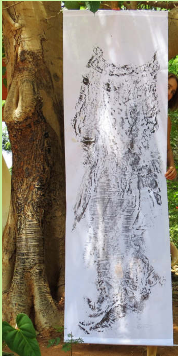
"Walking Tree Spirit" Ficus religiosa, banner 4 2019, 234 x 76 cm (left)