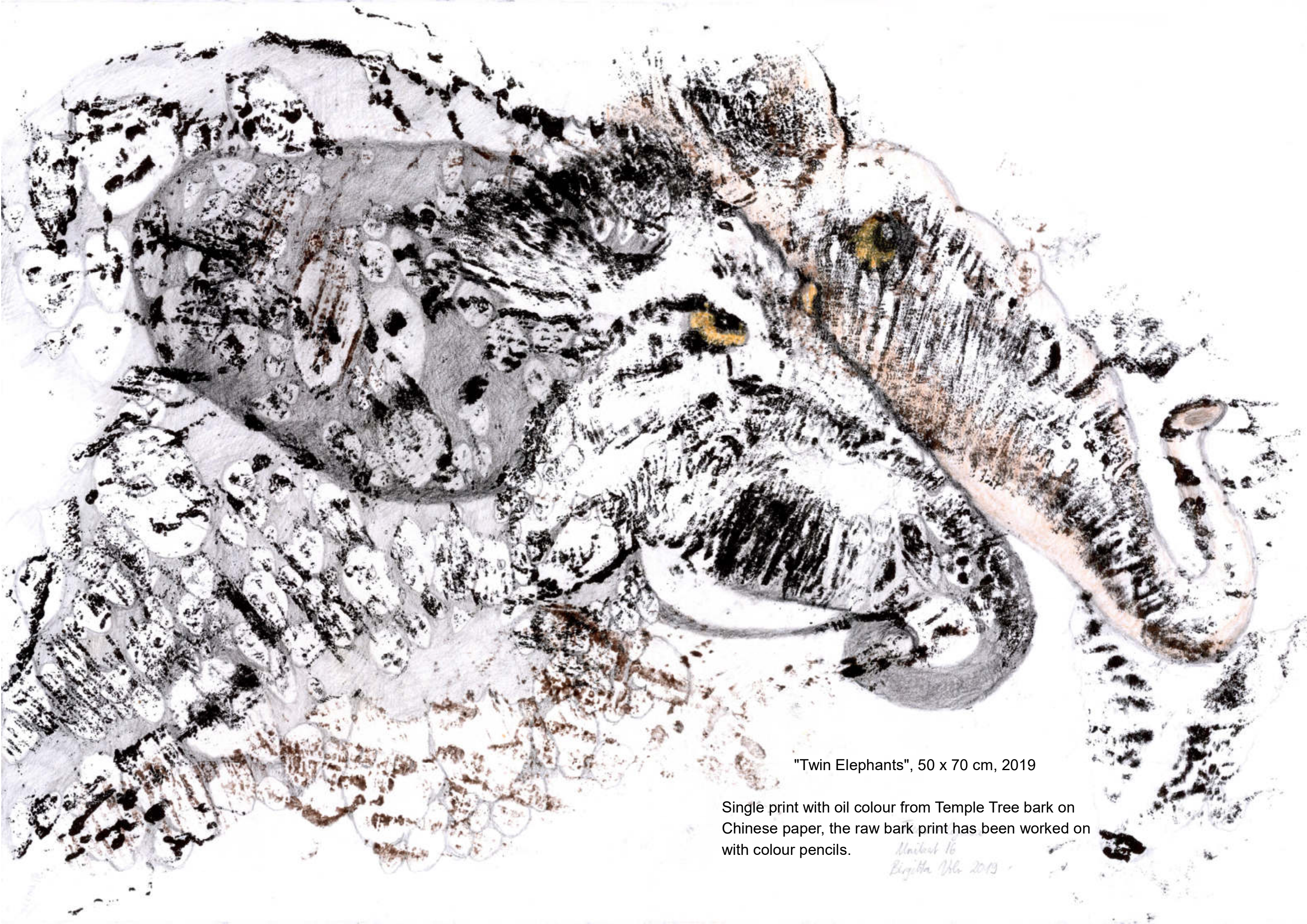
"Twin Elephants", 50 x 70 cm, 2019

Single print with oil colour from Temple Tree bark on Chinese paper, the raw bark print has been worked on with colour pencils.