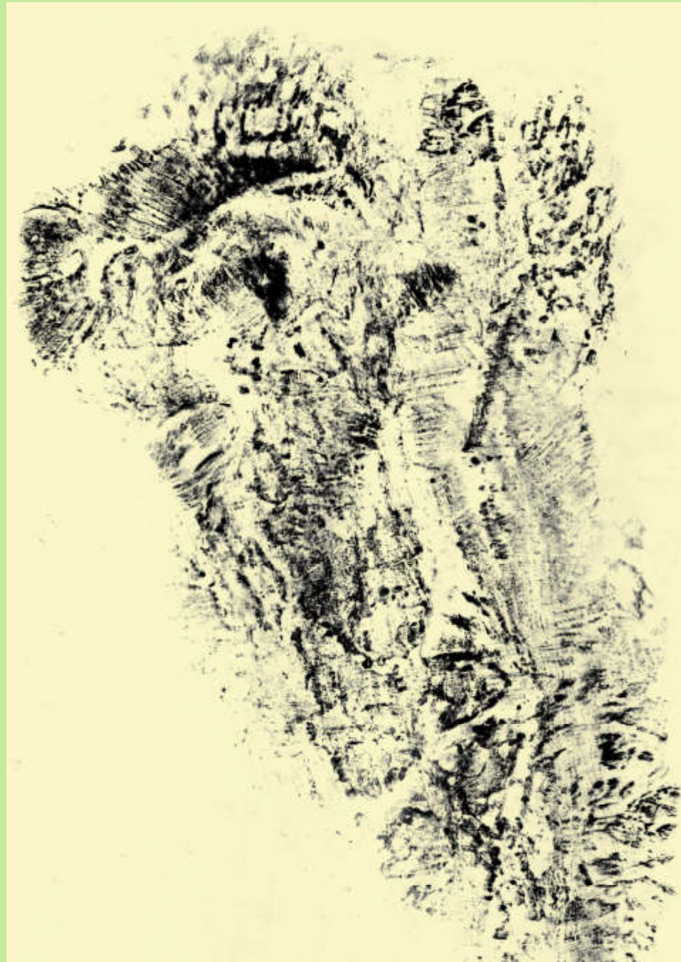
Two more stunning manifestations of "Lord Ganesha", the Indian elephant god, 2019, size 119 × 84 cm. Single prints with oil colour from Temple Tree bark on Chinese paper. These two prints manifested as seen on the first printing attempt.