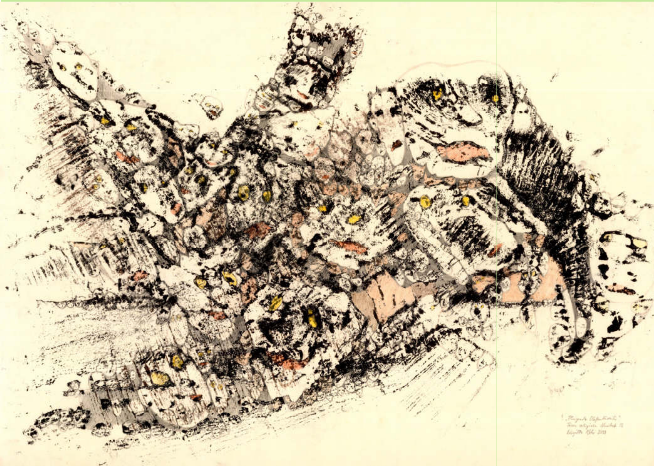
"Elephant Riders", 2019, 70 x 100 cm (above)