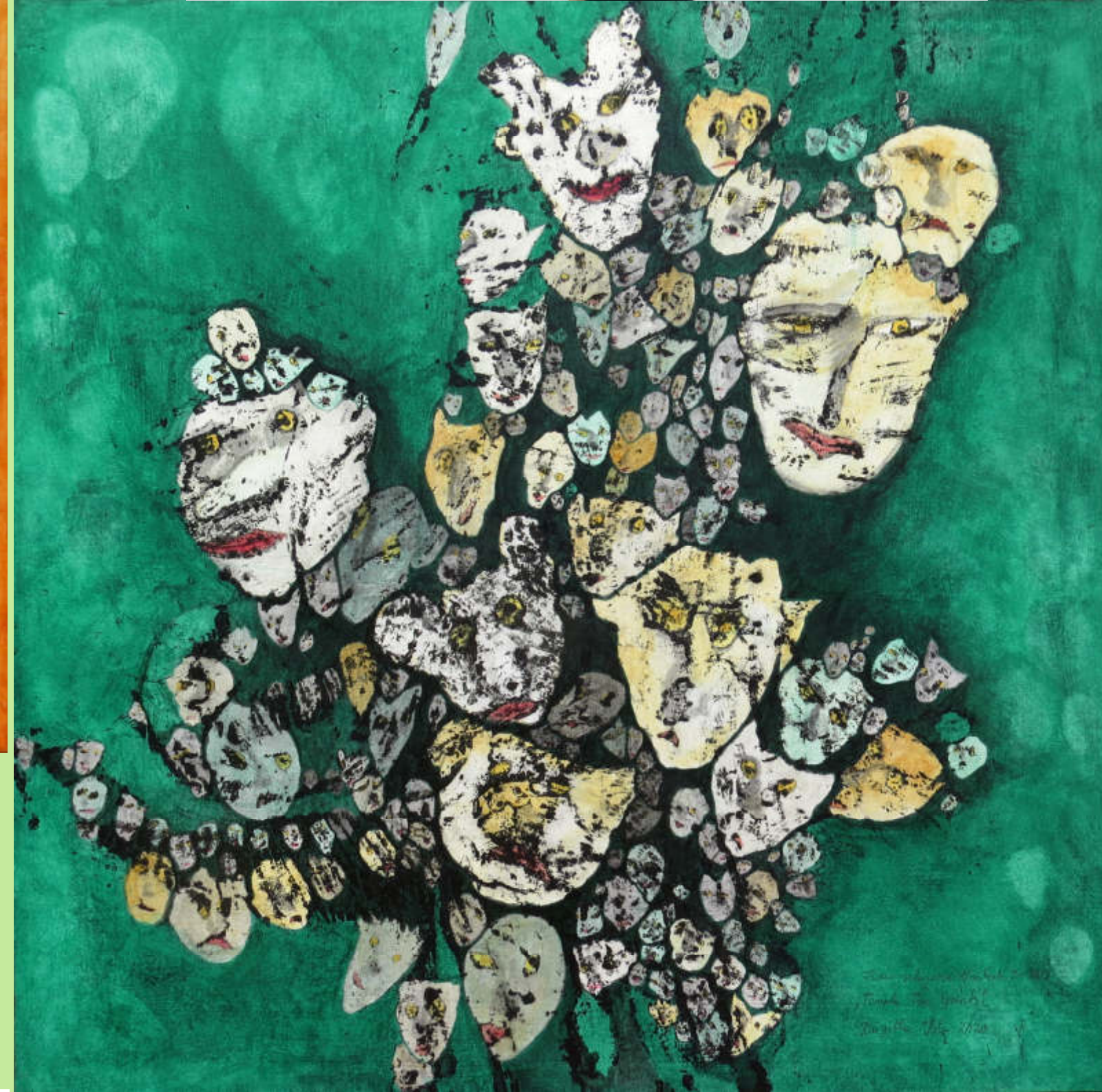
"Temple Tree Beings", 92 × 92 cm, 2020 (above) and "Temple Tree Spirits", 92 × 92 cm, 2020 (right)

Single piece prints with oil colour from a Temple Tree on Chinese paper, pasted on canvas and painted with acrylic colours.