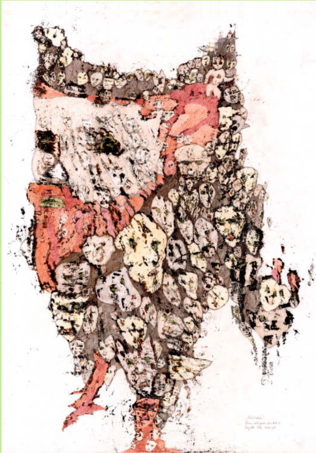
"Mischwesen - Chimaera", 2020, 100 × 70 cm (above)