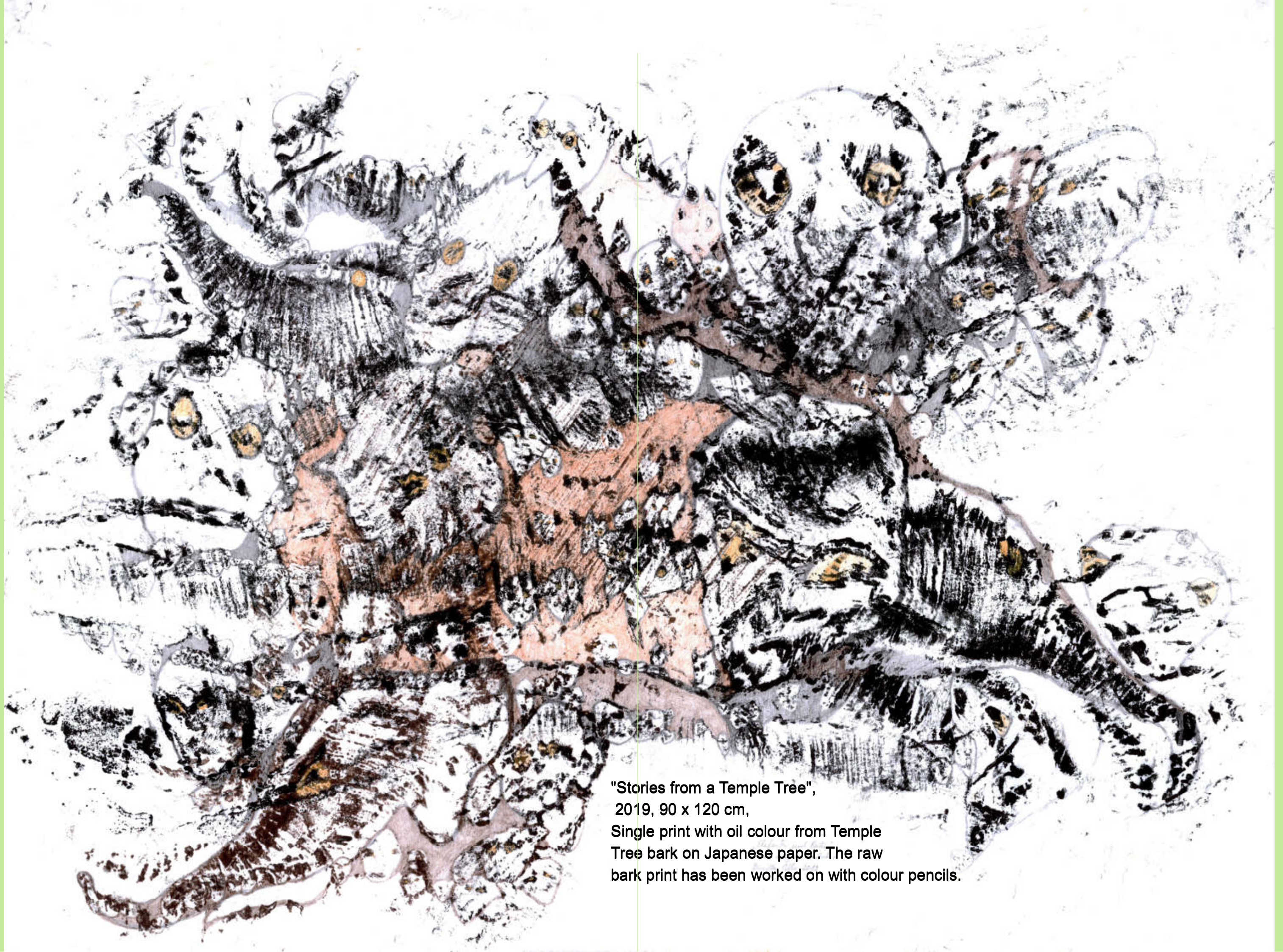
"Stories from a Temple Tree", 2019, 90 x 120 cm, Single print with oil colour from Temple Tree bark on Japanese paper. The raw bark print has been worked on with colour pencils.