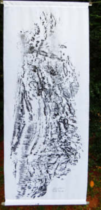
"Ficus religiosa" banner 2, 2019, 234 x 76 cm (left)