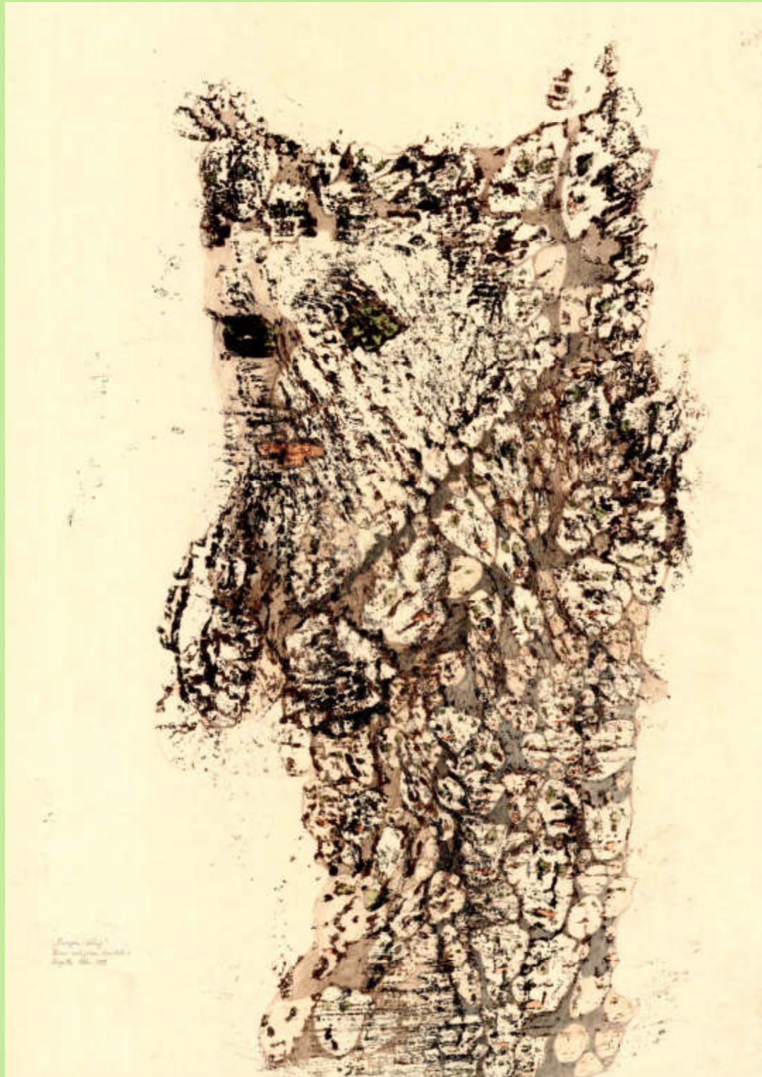
"King of the Dwarfs", 119 × 84 cm, 2019 (up) and "Dwarf with a Shrunken Head", 100 x 70 cm, 2019 (right)

Single prints with oil colour from Temple Tree bark on Japanese paper, the raw bark prints have been worked on with colour pencils.