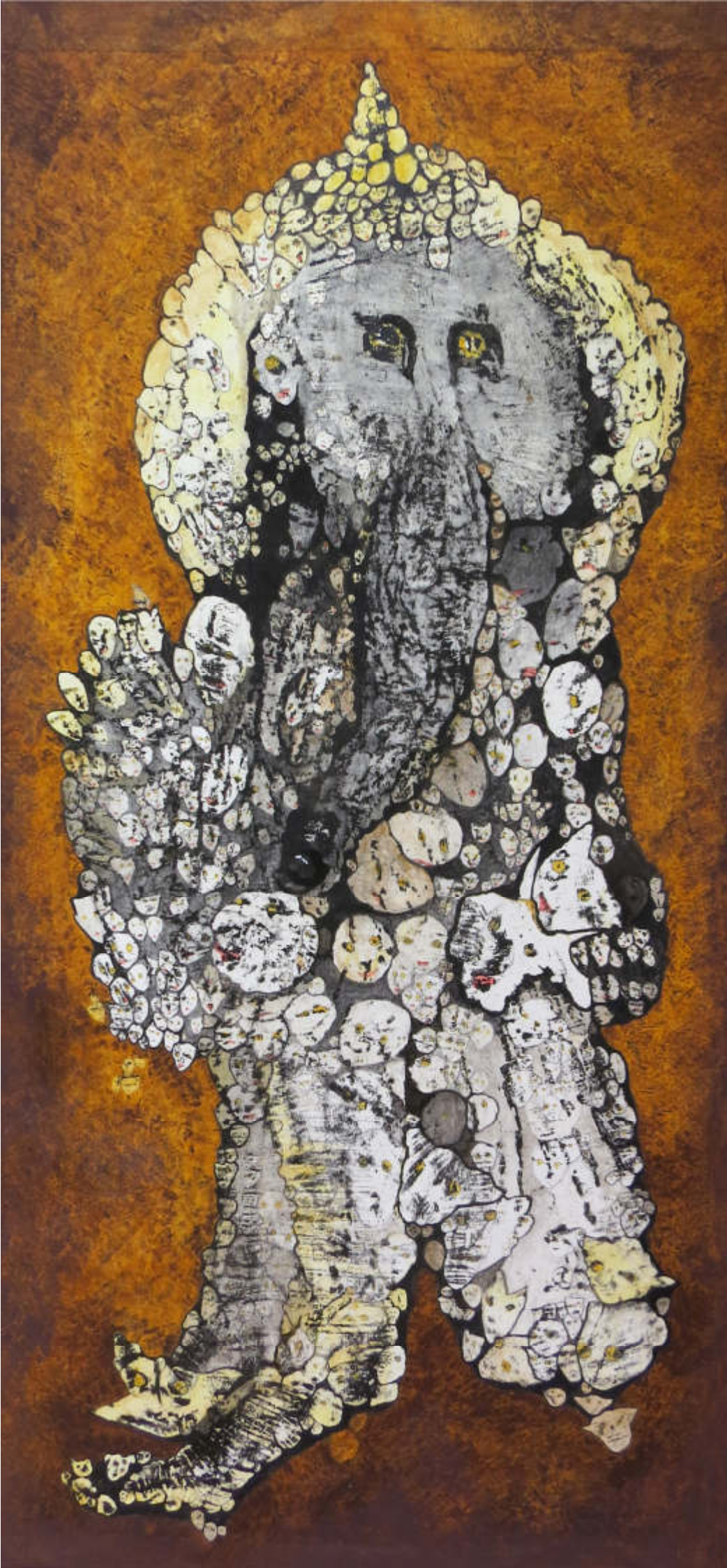
"Standing Ganesha", 200 x 100 cm

Single piece print with oil colour from a Temple Tree on Chinese paper, pasted on canvas and painted with acrylic colours